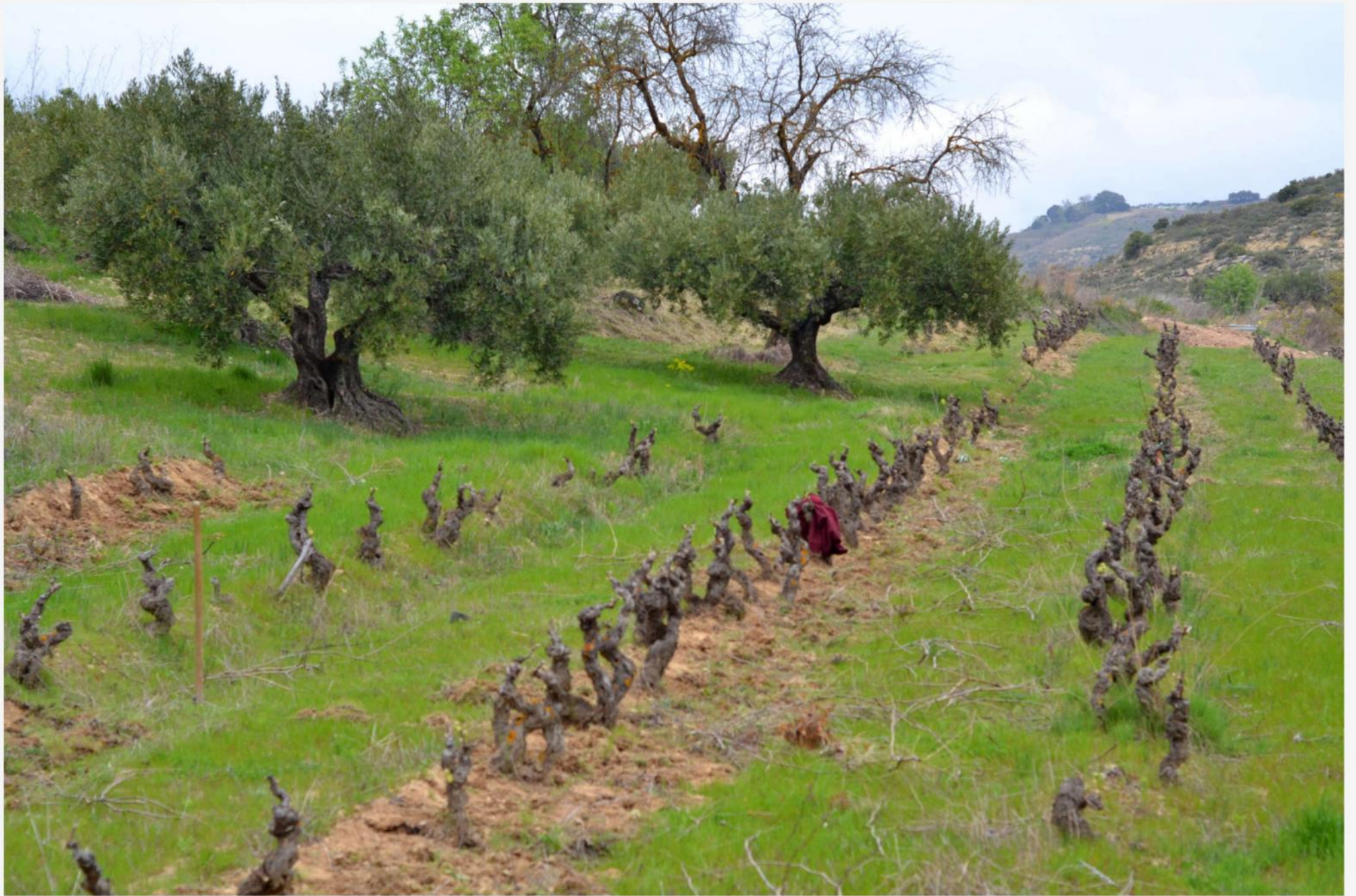
Example of biodiversity on the farm of El Plano.